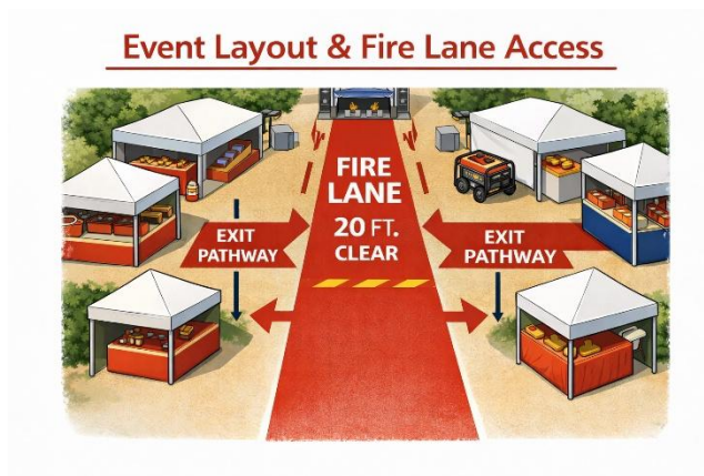
Fire Lane Requirements